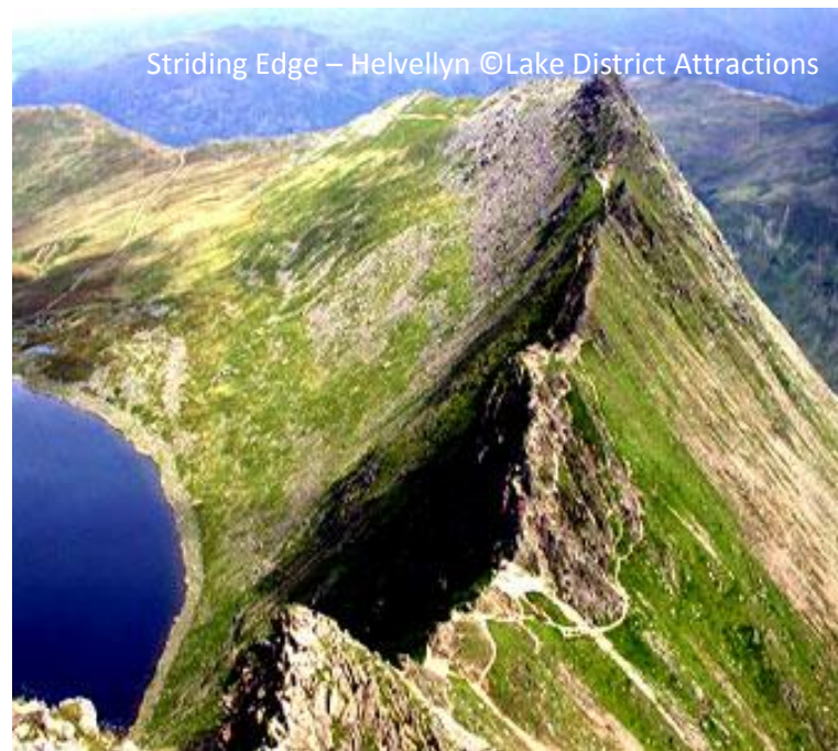
Striding Edge – Helvellyn

If you have any questions about the trip please feel free to email.